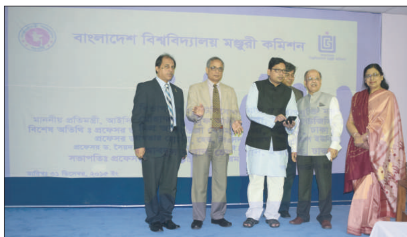
State Minister for Information and Communication Technology Division, Government of the People's Republic of Bangladesh, Zunaid Ahmed Palak, MP, inaugurating the new website of UGC as the Chief Guest at UGC Auditorium on 31 December 2015