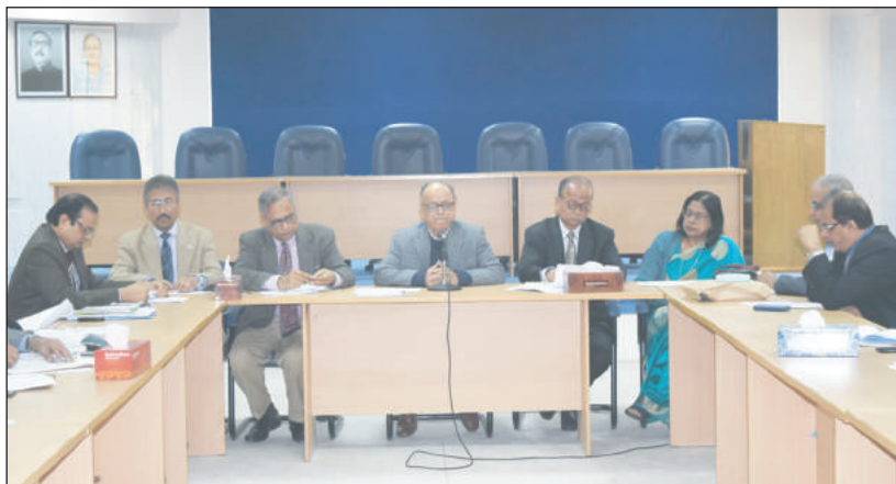
UGC Chairman addressing at a meeting of HEQEP