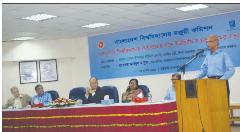
Education Minister Mr. Nurul Islam Nahid, MP speaking at a view exchange meeting with the authorities of Private Universities at UGC Auditorium on 13 August 2015