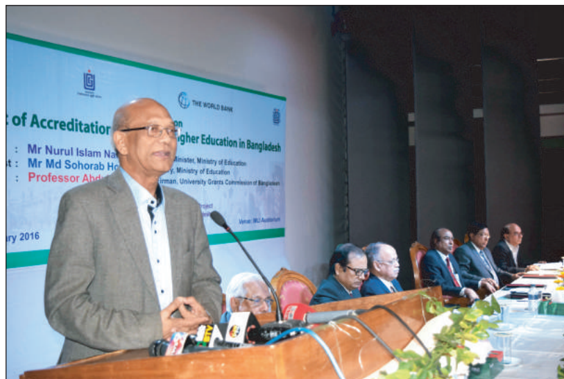
Education Minister Mr. Nurul Islam Nahid, MP speaking at a seminar on 'Draft Act of Accreditation Council for Higher Education in Bangladesh'