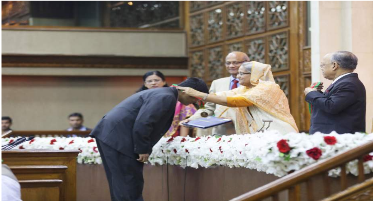
The Hon'ble Prime Minister Sheikh Hasina awarding Prime Minister Gold Medal to a graduate at the Prime Minister Gold Medal Award Ceremony on 6 January 2016