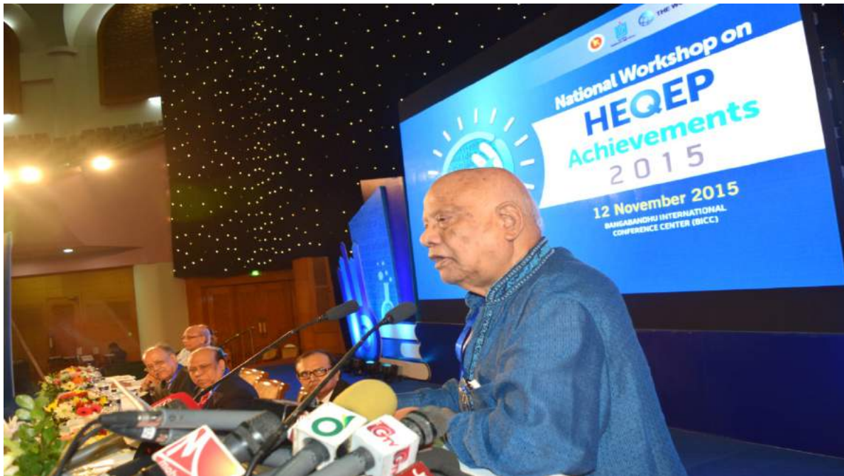
Finance Minister Mr. Abul Maal Abdul Muhith, MP, speaking as the Chief Guest at a national workshop on “HEQEP Achievement-2015” at Bangabandhu International Conference Centre on 12 November 2015

The key functions of the Planning and Development Division are to: