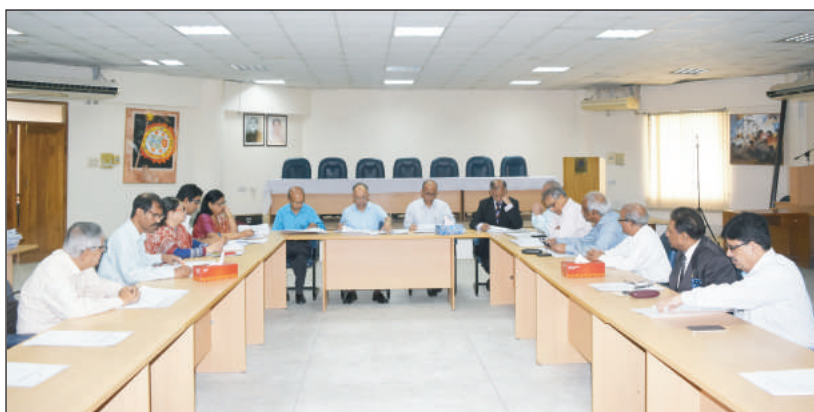
UGC Chairman and committee members at a “UGC Award” Advisory Committee Meeting