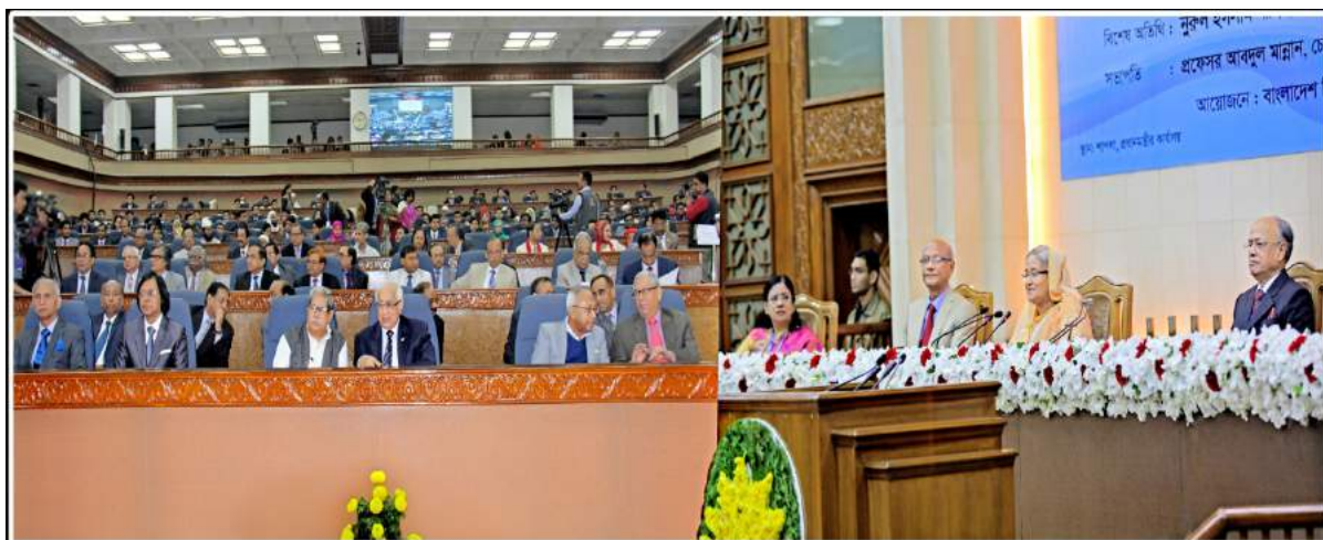
The Hon'ble Prime Minister Sheikh Hasina addressing at the Prime Minister Gold Medal Award Ceremony on 6 January 2016

The Research Support and Publication Division of the UGC contributes to the promotion of higher education through (i) Academic Staff Development Research Program for supporting regular research projects; (ii) Research Support Fund for partial financial support to the research activities; (iii) UGC Awards for outstanding research work; (iv) Award of MPhil, PhD and Post-Doctoral Fellowship; (v) UGC Professorship; (vi) Rokeya Chair and (vii) UGC Merit Scholarship.